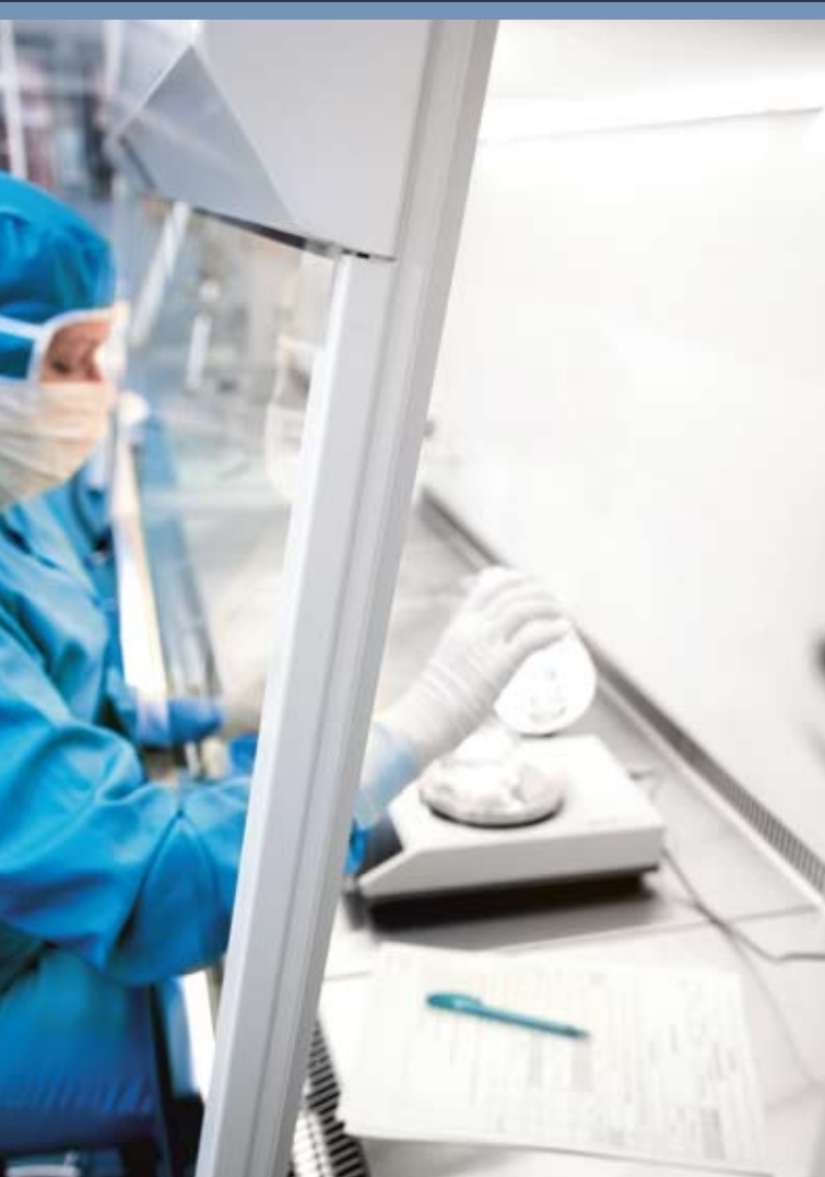
Diffused laminator technology allows shadow free light distribution throughout the chamber with light adjustment of 0-2000 Lux. illumination.