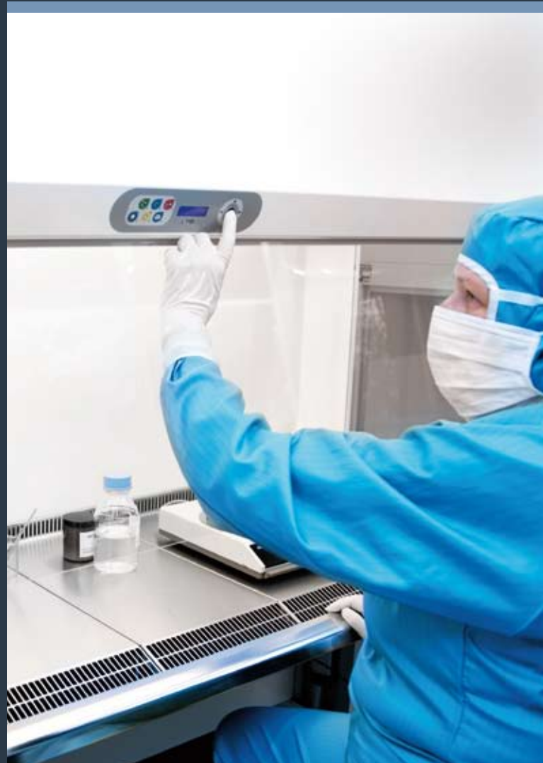
The cabinet can easily be adjusted from the service mode by authorized personnel. Down flow speeds can be adjusted from 0.10 m/s up to 0.55 m/s.